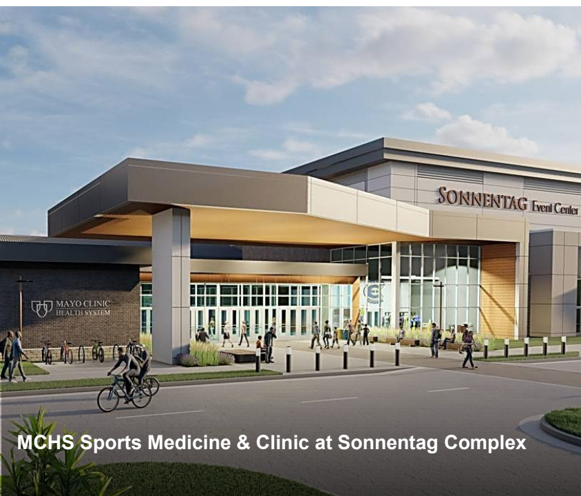
MCHS Sports Medicine & Clinic at Sonnentag Complex