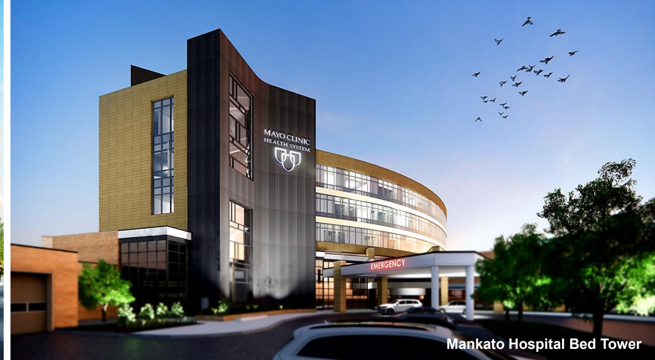
Mankato Hospital Bed Tower