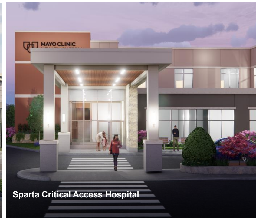
Sparta Critical Access Hospital