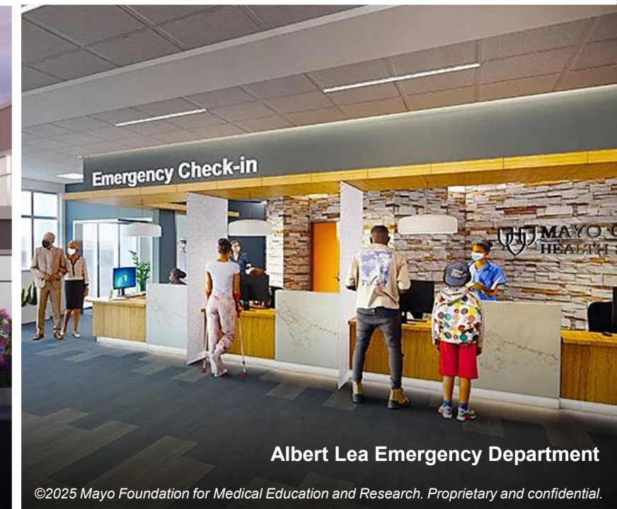
Albert Lea Emergency Department