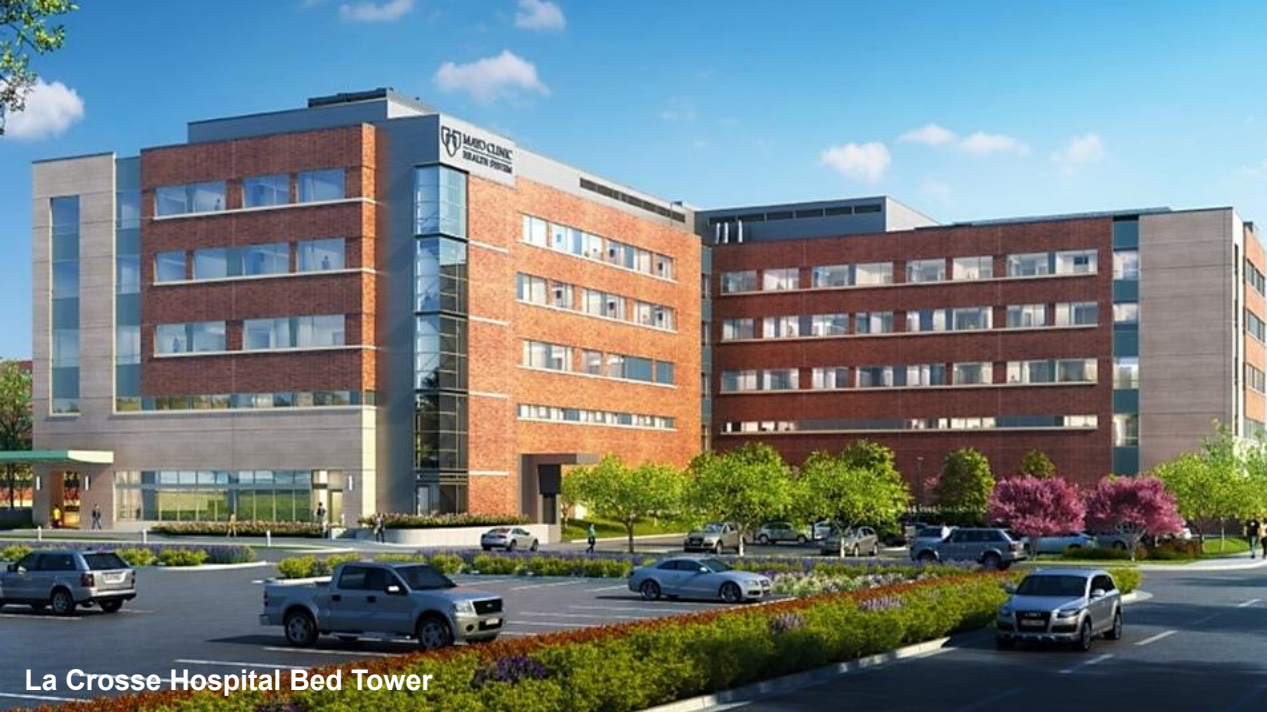
La Crosse Hospital Bed Tower